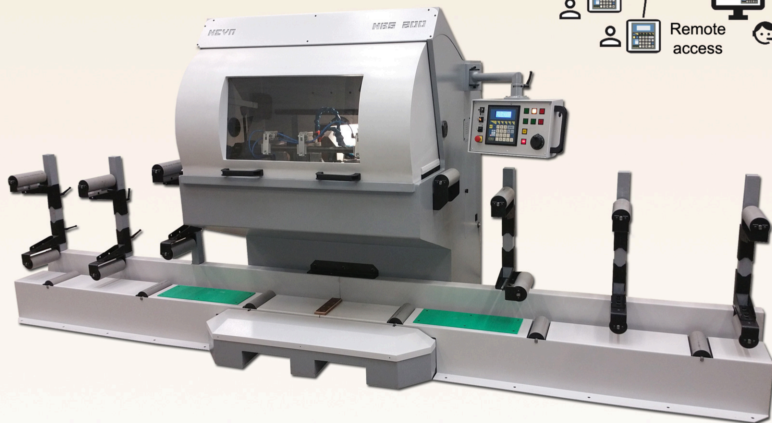
Constant pitch sharpening